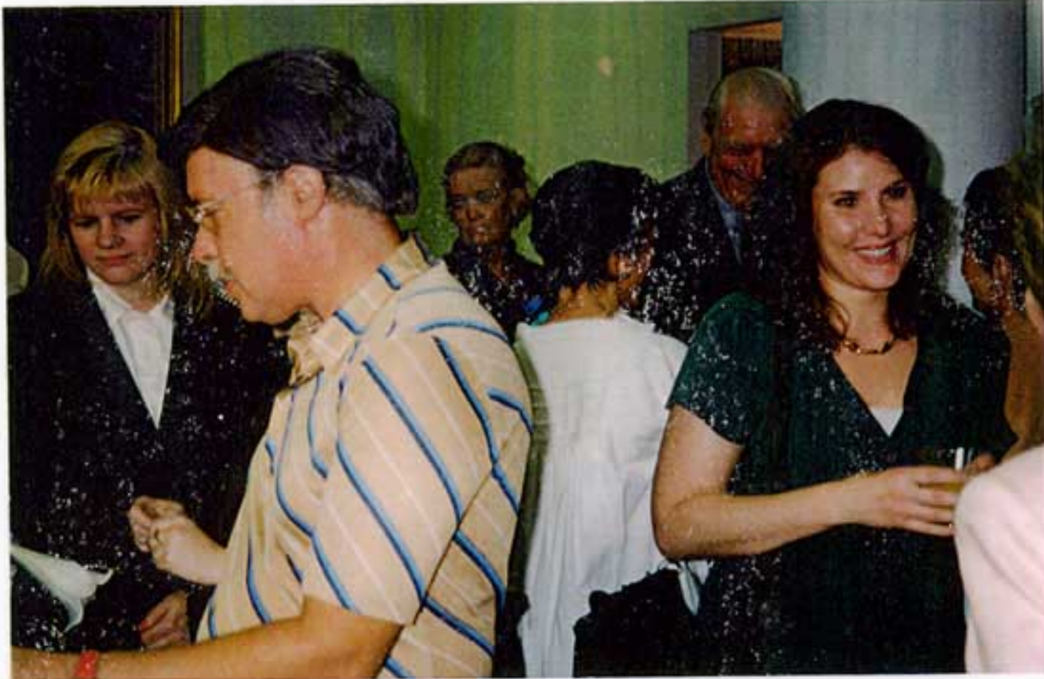
Gallery Montserri New York Aut 1995