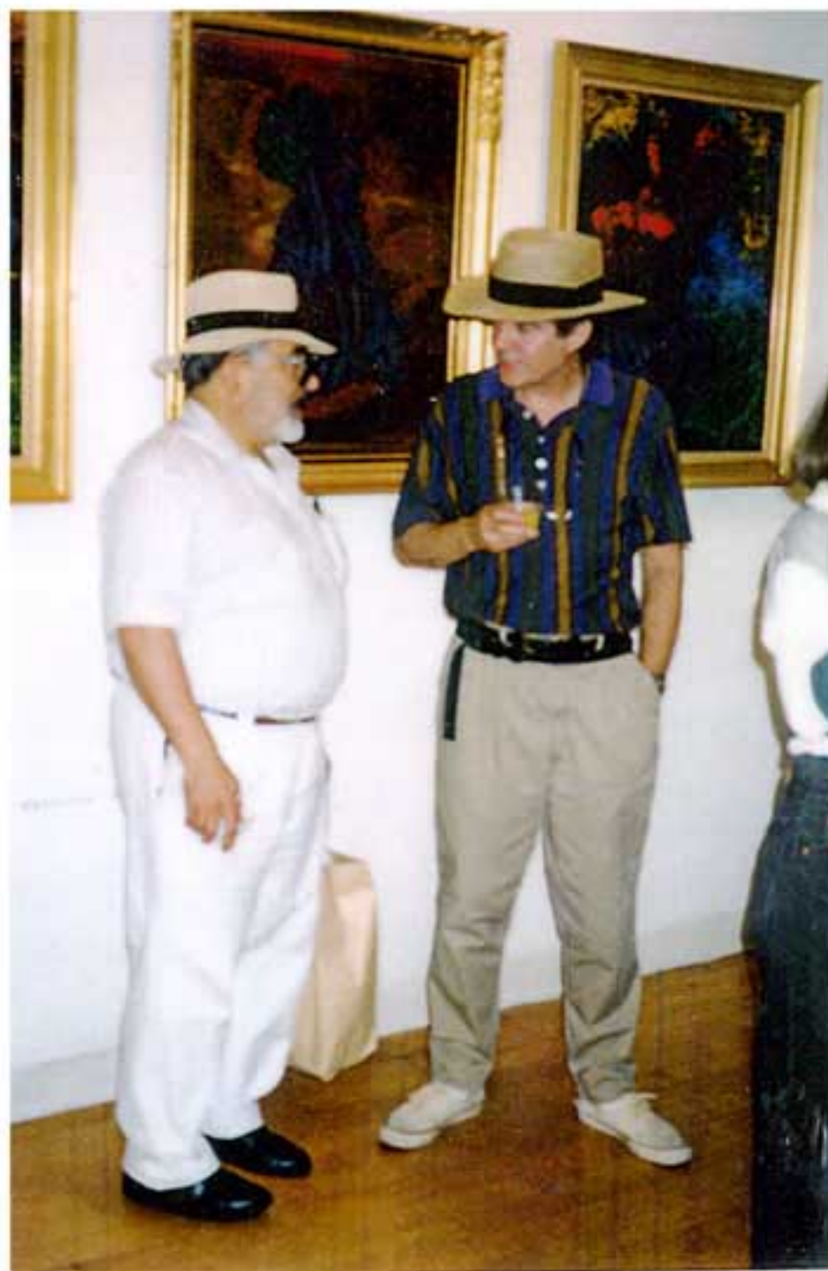
New York. 1995