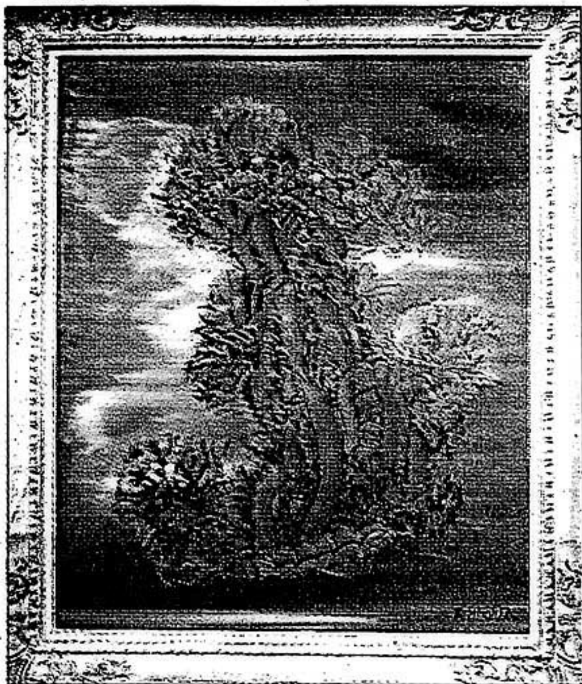
« Paradis de fleurs »